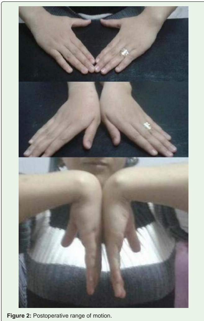
Figure 2: Postoperative range of motion.

Under general anesthesia. A volar 7cm incision beginning 2cm distal to Lister’s tubercle and extending proximally in the forearm