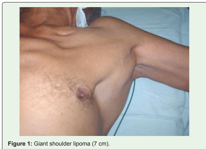
Figure 1: Giant shoulder lipoma (7 cm).