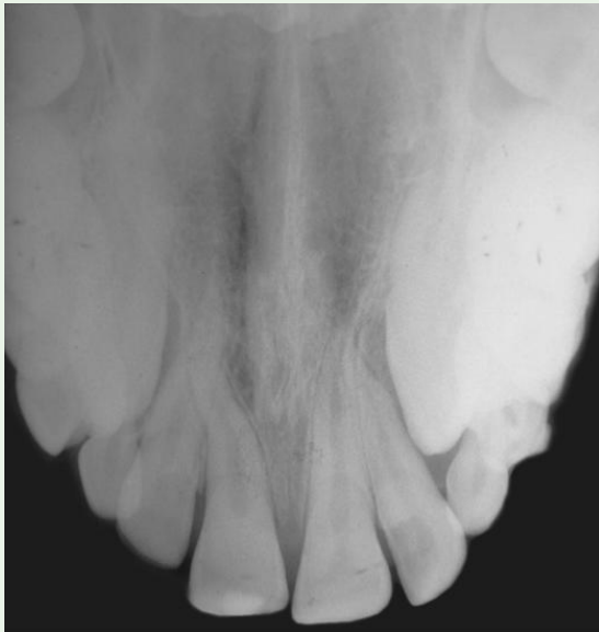
Figure 7: Final radiographic aspect.