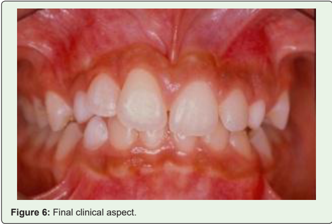
Figure 6: Final clinical aspect.

The histopathological exam was done confirming the diagnosis of a dentigerous cyst. The tooth 11 erupted spontaneously and ectopically six months later. Orthodontic treatment was applied to correct the tooth displacement (Figure 5). The follow-up of the patient through clinical and radiographic exams was carried out until the total eruption of the upper incisors (Figures 6 and 7).