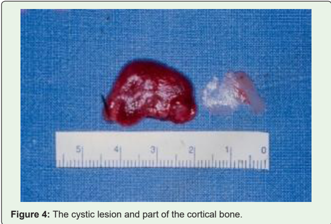
Figure 4: The cystic lesion and part of the cortical bone.