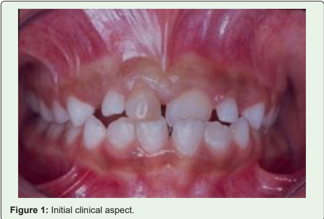
Figure 1: Initial clinical aspect.