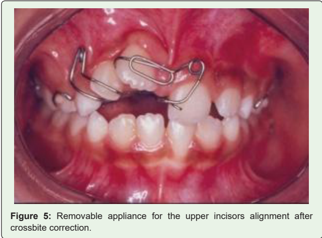
Figure 5: Removable appliance for the upper incisors alignment after crossbite correction.