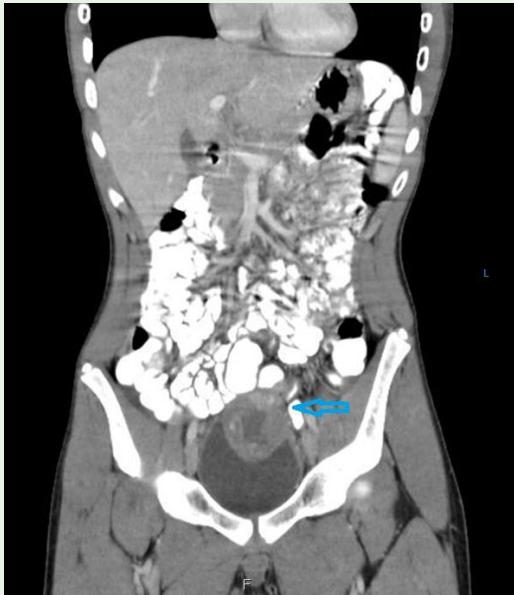
Figure 1: Solitary and round mass at the bladder dome.