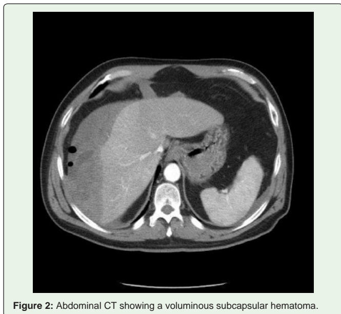
Figure 2: Abdominal CT showing a voluminous subcapsular hematoma.

Abdominal pain, with or without hypotension, would be a cause for concern. Once the diagnosis is made, patients have to be closely monitored and given broad-spectrum antibiotic therapy. Most cases are managed conservatively, with periodic radiological checks [3]. In cases of progression, selective embolization of some hepatic arterial branches can be considered, keeping back the surgical intervention for cases with haemodynamic instability or signs of haematoma infection.