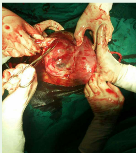
Figure 1: Placenta Percreta.