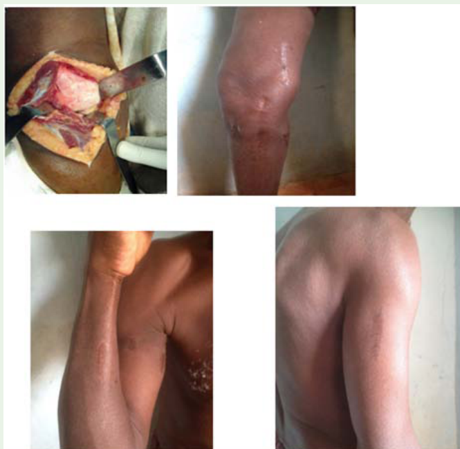
Figure 6: A. Surgical resection of the exostosis of the right humerus in one of our patient. B, C and D: Post-surgical scars in one of our patient.

Standard radiographs showed a sessile aspect of exostosis localized to the limbs in 14 patients and a pedicle aspect in 2 patients. There was a patient who had both aspects. After the end of the growth period, the trend was marked by a resumption of activity in