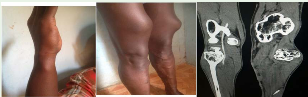
Figure 1: Bone swelling in the distal third of the right forearm and distal third of the thighs and proximal third of the legs. They are associated with varicose veins in the left leg. The angiography scan of the lower limbs shows a continuity between the spongy bone spans and the cortical spans of exostosis and carrier bones (green arrow). It shows close contact between an osteochondroma of the upper end of the left tibia and the left popliteal artery. The right leg tripod has contrasts hot unlike its left counterpart (blue arrows). There is also deep venous dilation and varicose veins of the superficial network (orange arrows).

The three families had a total of 108 members. Fifteen of them had multiple exostosis disease. There were 13 men and 2 women (sex