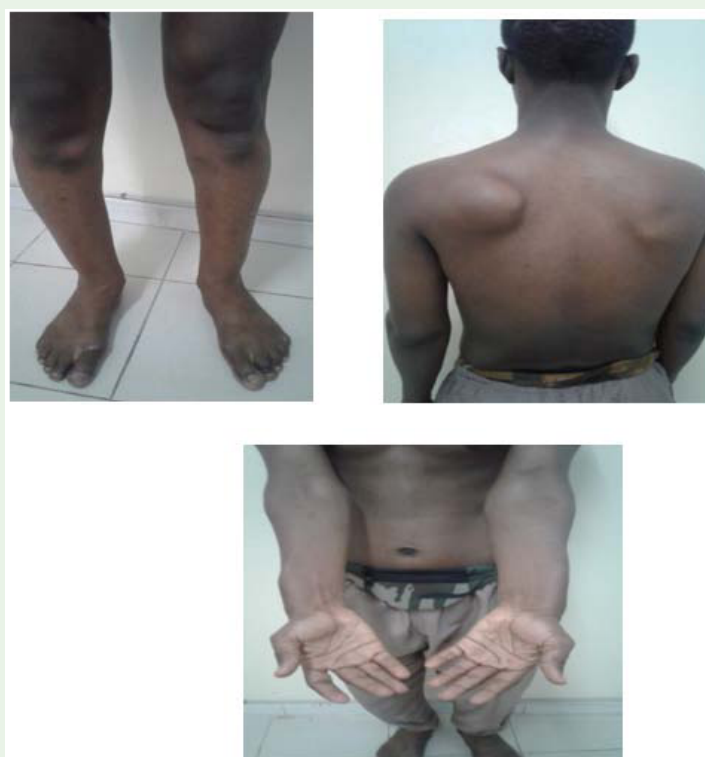
Figure 3: Bone swelling in the lower limbs and on the left scapula. Incurvation of the medially concaved forearms. The thoracic scan shows exostosis developed at the expense of the left scapula.