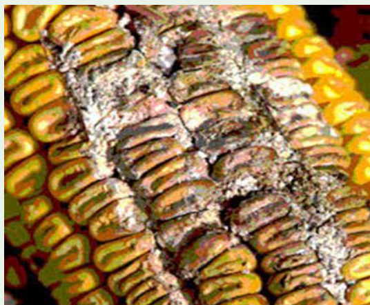
Figure 1: Maize corn contaminated by mould and aflatoxin.

In contrast to the infectious diseases, mycotoxins, because of their chronic effects on human being, have been neglected in most developing countries. No data is available on mycotoxin contamination of Mozambican commodities although our own unpublished surveys shows levels of up to 100% of dried “grey” cassava (a staple food in the northern region) contaminated (Figure 2).