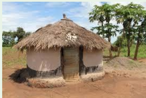
Figure 3: Cassava storage.

Many countries have regulations specifying the maximum allowed concentration of mycotoxins, but there are no regulations requiring measures to reduce contamination. If not legally required, producers are reluctant to invest in approaches that would reduce mould growth. Considerable effort, however, is spent on quantifying mycotoxins in food and on developing methods that are able to detect increasingly lower concentrations. Perhaps now is the time to divert some of these efforts towards methods that reduce the problem, specifically preventing mould growth and affordable methods to eliminate mycotoxins from contaminated food. These also require education and training of those who need to apply the knowledge.