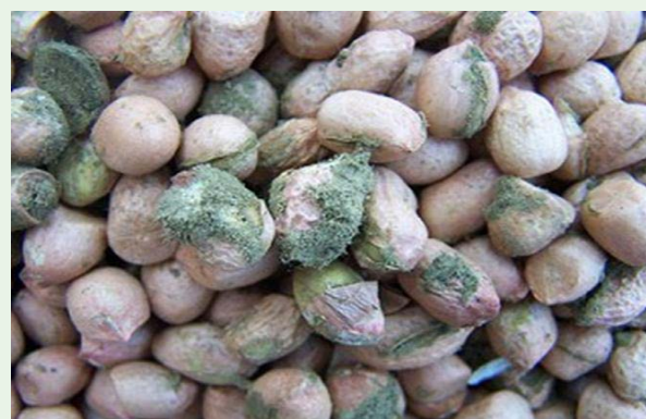
Figure 5: Aflatoxin-contaminated groundnut kernels from Mozambique.

Human exposure to levels of aflatoxins from nanograms to micrograms per day occurs through consumption of maize, cassava and peanuts [31], which are dietary staples in several tropical countries. The chronic incidence of aflatoxin in diets is evident from the presence of aflatoxin in human breast milk [32]. Some authors demonstrate the role of aflatoxicosis in general chronic malnutrition [33]. Others state that increasing levels of aflatoxin is linked to an increased prevalence of stunting and underweight [34] (Table 1).