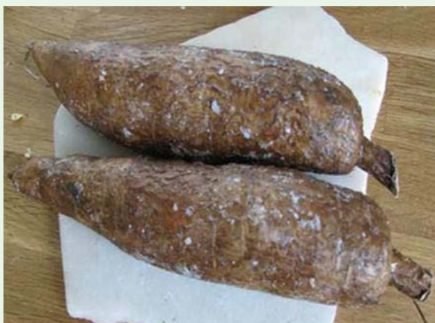
Figure 2: Cassava contaminated by mould and mycotoxins.

The chemical structures of mycotoxins produced by these fungi are very diverse as are the characteristics of the mycotoxicoses they can cause [27]. Because of their pharmacological activity, some