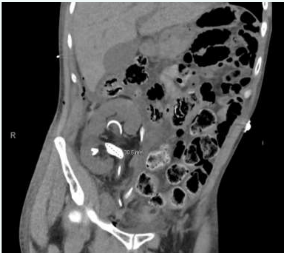
Figure 1a: CT scan coronal view post kidney transplant depicting a large donor-gifted calculus with moderate lower calyceal hydronephrosis and adequate drainage of upper pole by double-J ureteral stent

Previously, the acceptance of deceased donor kidneys with stones was a relative if not absolute contraindication to kidney transplantation [1,2]. However, favorable experience with transplanting living donor kidneys with isolated stones as well as successful management of de novo stone formation following living or deceased donor kidney transplantation have provided insights regarding the benefits and risks of this strategy [3-9]. The limited supply of available donor kidneys has led to a reexamination