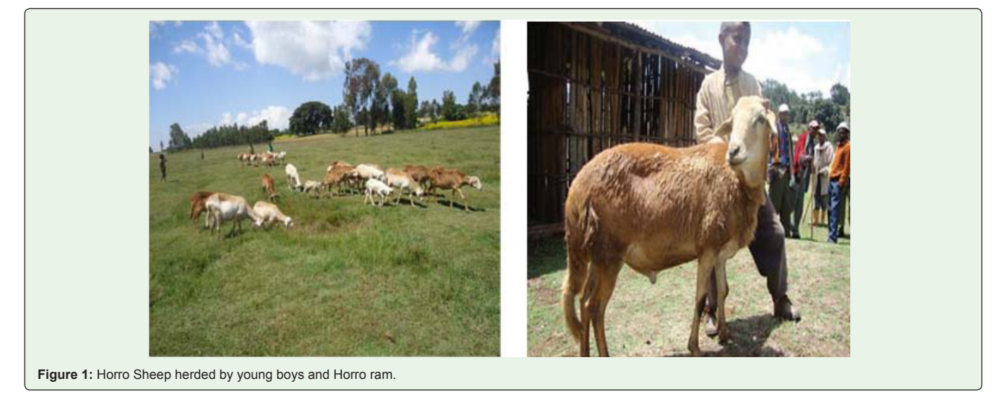
Citation: Tadesse TK. Horro Sheep Breeds Improvement Breeding Program. Int J Anim Sci. 2019; 3(2): 1044.

Community based breeding programs are a new approach of genetic improvement program proposed for the low input traditional smallholder farming system. The community-based breeding strategies also consider the production system holistically and involve the local community at every stage, from planning to operation of the breeding program [26]. The breeding structure of such a program is commonly single-tiered with no distinction between the breeding and production units, i.e., the farmers are both breeders and producers [4].