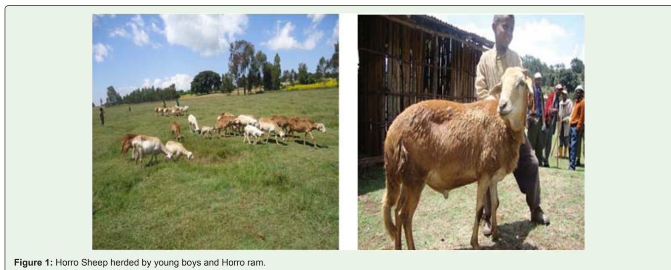
Figure 1: Horro Sheep herded by young boys and Horro ram.

Community based breeding programs are a new approach of genetic improvement program proposed for the low input traditional smallholder farming system. The community-based breeding strategies also consider the production system holistically and involve the local community at every stage, from planning to operation of the breeding program [26]. The breeding structure of such a program is commonly single-tiered with no distinction between the breeding and production units, i.e., the farmers are both breeders and producers [4].