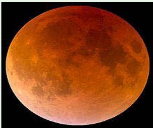
Figure 1: Photograph of full moon during the total lunar eclipse of 28 September 2015.

On Sleep: On earth the biology of life can be influenced by different factors like moon, tide, geographical cycle [15,16] There is a very good analysis that depicts that lunar cycle effect on not only sleep, but also some endogenous hormonal matter like melatonin level, cortisol level, Electroencephalogram activity (EEG), non Rapid Eye Movement sleep (NREM) [1,2]. They indicated that during full moon EEG activity decreased during NREM by 30% and time to fall asleep increases by 5 minutes. Ultimately sleep duration was reduced by 20 minutes.