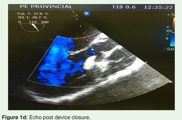
Figure 10. Echo post device closure.

Percutaneous closure: Cardiac catheterisation with a femoral approach was performed using general anaesthesia. A left ventricular angiogram was done and disclosed a significant left to right shunt across the large defect in the muscular ventricular septum (Figure 1b). The VSD was measured using the fluoroscopy (Figure 1c). Initially Amplatzer muscular VSD Occluder was selected to close the defect, the device formed cobra deformity during the deployment and could