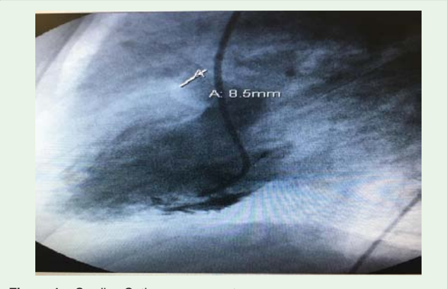
Figure 1c: Cardiac Cath measurements.

Percutaneous closure: Cardiac catheterisation with a femoral approach was performed using general anaesthesia. A left ventricular angiogram was done and disclosed a significant left to right shunt across the large defect in the muscular ventricular septum (Figure 1b). The VSD was measured using the fluoroscopy (Figure 1c). Initially Amplatzer muscular VSD Occluder was selected to close the defect, the device formed cobra deformity during the deployment and could