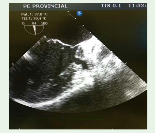
Figure1a: Echo at presentation.