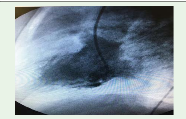
Figure 1b: LV angiogram.