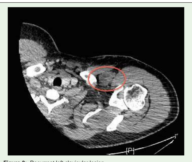
Figure 3: Recurrent left clavicular lesion.

Resection of the proximal disease was performed including the left clavicular and bicep lesions as well as left axillary lymph node dissection. The forearm lesion was deemed unresectable because of median nerve involvement and left in situ. At the same operation, following resection, left upper extremity ILI was performed using