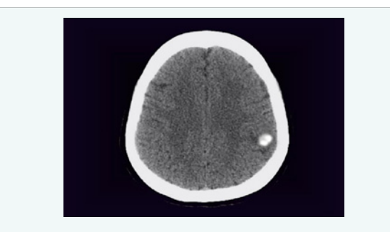
Figure 1 Axial CT illustrates calcified heterogenous hyperdensity in the left posterior parietal lobe.