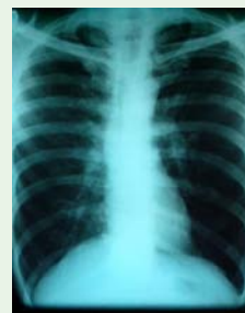
Figure 5: Chest radiography on January 2015 showing regression of tuberculous lesion.

the fact that fever was due to isoniazid. Patient was asymptomatic in follow up period and became sputum negative after 2 months and was declared free of Tuberculosis after 6 months. Chest radiograph done in January 2015 showed COPD changes and regression of lesion in right upper zone (Figure 5).