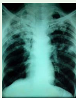
Figure 2: Chest radiograph showing pulmonary Koch's in June 2014.

examination and investigations revealed no secondary infection. Blood cultures, urine culture, serology for influenza, HIV, HBV, HAV, HCV (Hepatitis A, B and C) and sputum examination were negative for other infections. Patient was continued with ceftriaxone and azithromycin.