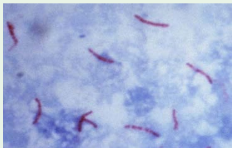
Figure 4: Ziehl-Neelsen staining of sputum showing Acid fast bacilli.