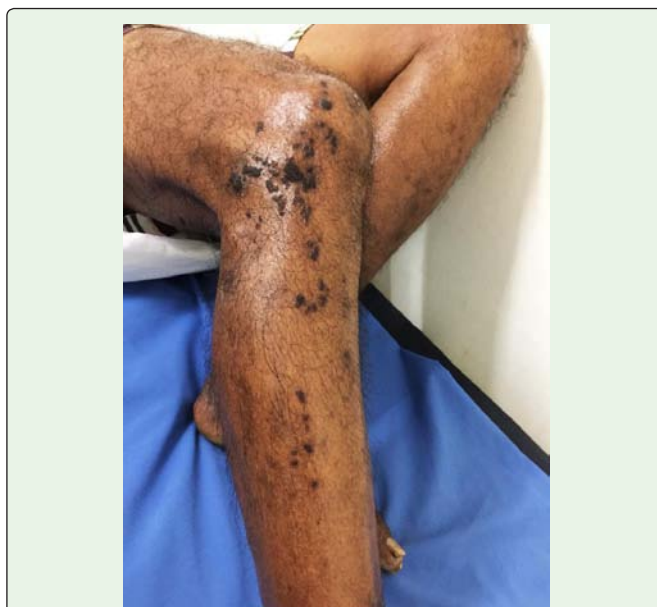
Figure 1: Clinical photograph showing multiple, pigmented, verrucous papules and plaques present over the extensor aspect of the right leg.

Dermatological examination revealed multiple, pigmented, verrucous papules and plaques present over the extensor aspect of the right leg (Figure 1) and dorsum of the right hand (Figure 2). Multiple pits were present over the both the palms (Figure 3). Scalp, oral mucosa, soles, nail and