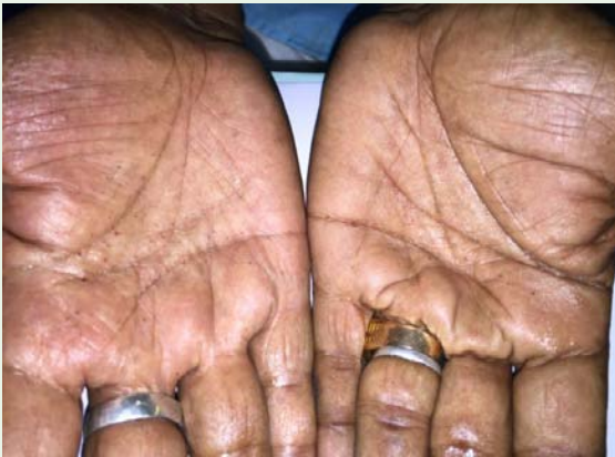
Figure 3: Clinical photograph showing multiple pits present over the palms.