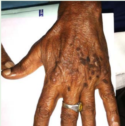
Figure 2: Clinical photograph showing multiple, pigmented, verrucous papules present over the dorsum of the right hand.