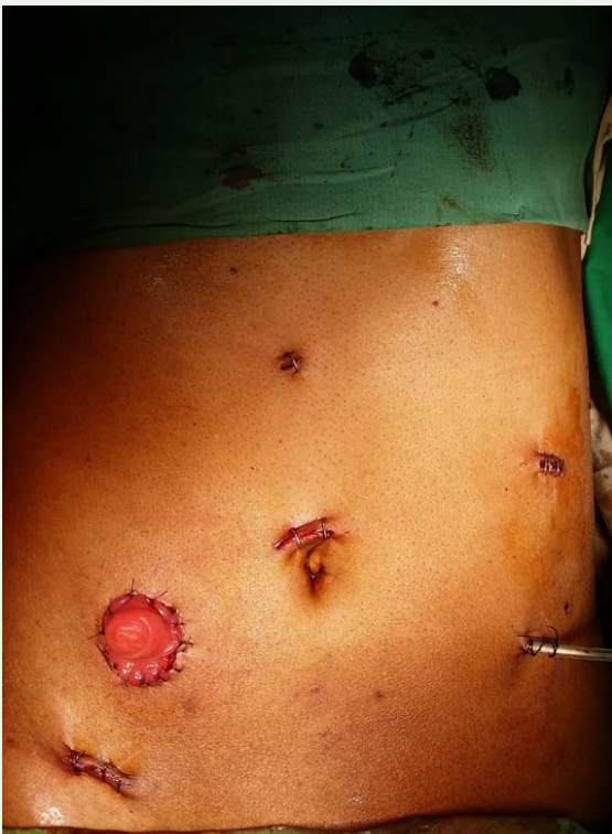
Figure 2: Endosonography showing L/adrenal mass.

of colorectal malignancies. Physical examination including digital rectal examination was unremarkable. He did not have any features suggestive of Cushing’s syndrome either. Colonoscopy revealed a circumferential polypoidal growth at recto-sigmoid junction and histology revealed moderately differentiated adenocarcinoma. Serum Carcinoembryonic Antigen (CEA) level was normal (1.34 ng/mL). The initial assessment with Contrast Enhanced Computed Tomography (CECT) of the abdomen and pelvis showed rectal adenocarcinoma (T3N0M0) without any evidence of metastatic disease. However repeat assessment after neo-adjuvant therapy CECT (Figure 1) of the thorax and the abdomen revealed a (1.3 x 1.6 cm) well-defined