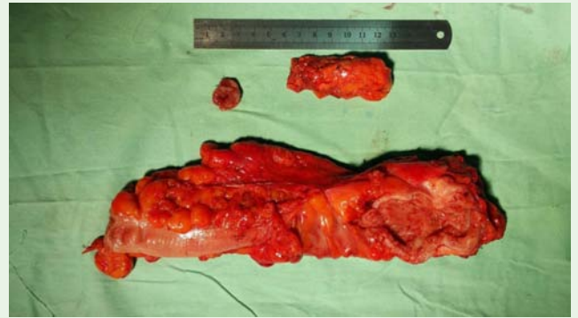
Figure 3: Patients abdomen showing Laparoscopic port sites and ileostomy.

hypodense non enhancing lesion in the L/adrenal (density of 20 HU) with suspicious imaging characteristics (without rapid washout) (Figure 1) and 3 mm lesion in the segment IV of the liver. Biochemical assessment for hormonal hyper-secretion revealed normal results for urine Vanillylmandelic Acid (VMA), overnight dexamethasone suppression test, 9 am testosterone and Aldosterone Rennin Ratio (ARR). Subsequently the lesion was assessed with Endosonography (EUS) to delineate left adrenal lesion (Figure 2) which showed a 1.5 x 2 cm solitary heterogeneous mass lesion in the left adrenal. A metastatic deposit of the left adrenal was suspected since it appeared within 4 months of the initial CECT (together with a new liver lesion) and because of the higher density and heterogeneity of the adrenal lesion on EUS examination. He underwent total laparoscopic high anterior resection with a defunctioning ileostomy and left adrenalectomy (Figure 3). His post-operative recovery was uneventful and patient was discharged on postoperative day 4. Pathological examination of the anterior resection specimen (Figure 4) revealed residual invasive adenocarcinoma of the rectum and the lymph nodes were negative for metastatic disease. His adrenal gland showed a well circumscribed lesion with a thick capsule without evidence of invasion. Tumour composed of cords and nests of polygonal cells with clear to fine granular cytoplasm suggestive of benign adrenal adenoma with a thick surrounding capsule.