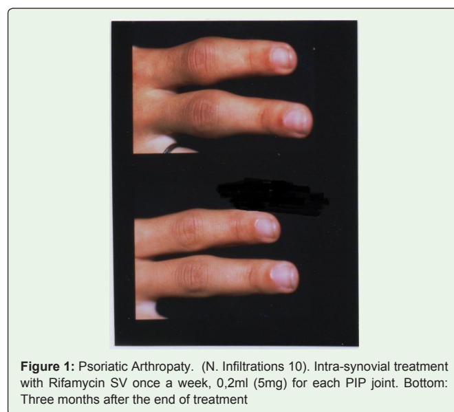
Figure 1: Psoriatic Arthropaty. (N. Infiltrations 10). Intra-synovial treatment with Rifamycin SV once a week, 0,2ml (5mg) for each PIP joint. Bottom: Three months after the end of treatment

In general, the small joints of the RA respond less well than big ones to treatment with Rifamycin SV; those of the carpus respond very poorly to it. However, in a certain percentage of cases of both RA and of PsA patients, the Rx-negative synovitis of small joints may heal completely with a weekly infiltration of Rifamycin SV repeated for 10 weeks (Figure 1).