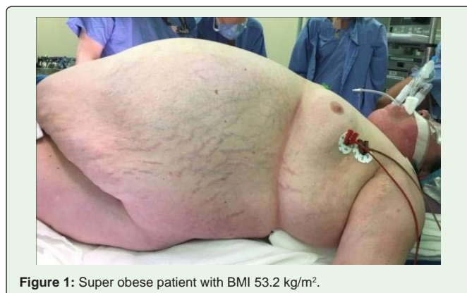
Figure 1: Super obese patient with BMI 53.2 kg/m 2 .

All four patients underwent RBTA. Table 1 shows the total operative and console times. Operative times and console times increased as the BMI increased. The gland sizes were measured as follows (left/right): patient #1, 7.2/6.5 cm; patient #2, 7.9/7.1 cm; patient #3, 6.5/6.0; and 7.0/5.0 cm for patient #4. The gland weights were (left/right): 16.1/12.3 grams for patient #1, 22.9/25.8 grams for patient #2, 76/26 grams for patient #3, and 114.5/44.7 grams for patient #4. Blood loss in all patients was minimal. The super-obese patient suffered a small liver laceration due to a large and difficult to retract fatty liver. The laceration was controlled with pressure and a Surgicel Nu-Knit hemostatic sheet. There were no other complications. Length of hospital stay per patient is listed in Table 1. At a mean follow up of 10 months all patients have been successfully treated.