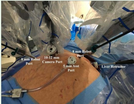
Figure 3: Robotic docking and trocar placement for transabdominal adrenalectomy in a super obese patient.