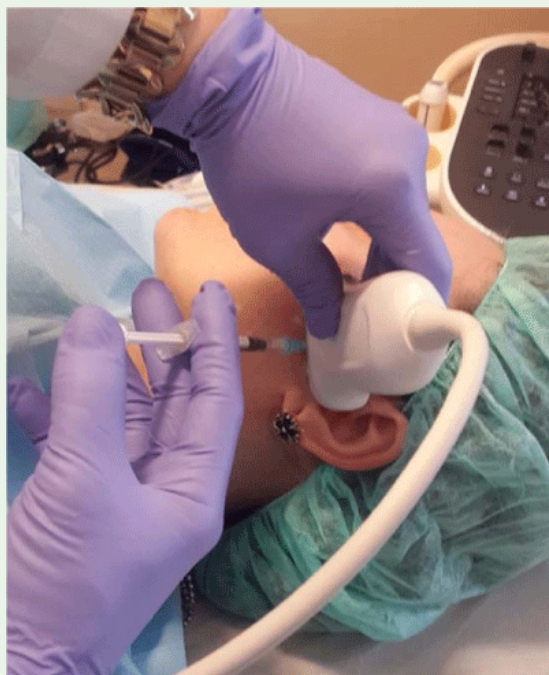
Figure 2: Injection of BTX-A into the lateral pterygoid muscle.

The presence of complaints about periodic headaches (19.78%), migratory pain in the face, neck and TMJ (14.28%), with painless palpation of the TMJ, are apparently connected with this phenomenon.