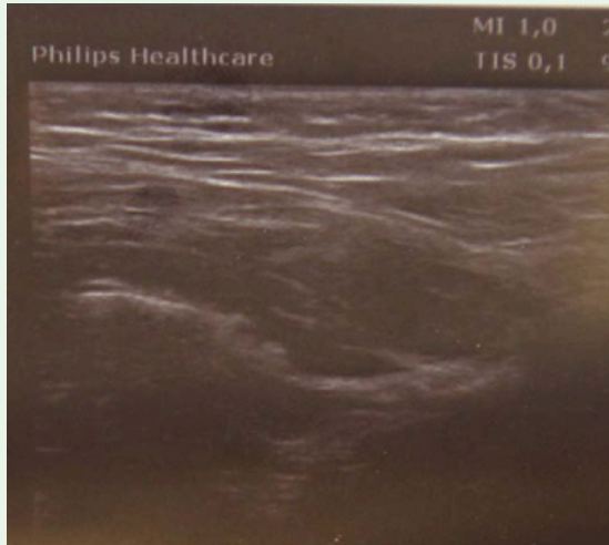
Figure 1: Ultrasonography image of lateral pterygoid muscle.

hypertonicity of the masticatory muscles resulting in the formation of trigger points significantly reduced the quality of life and led to increase the number of complaints. This symptomatology is associated with the previously compensated overload of the muscular complex. As a result of a sharp change in occlusal contacts and passive stretching of the masticatory muscles, the myostatic reflex was triggered and manifested in an increased masticatory muscles tone and led to the collapse of the compensatory mechanism, which determined the transition of latent trigger points to active and, consequently, clinical manifestation of myofascial pain syndrome.