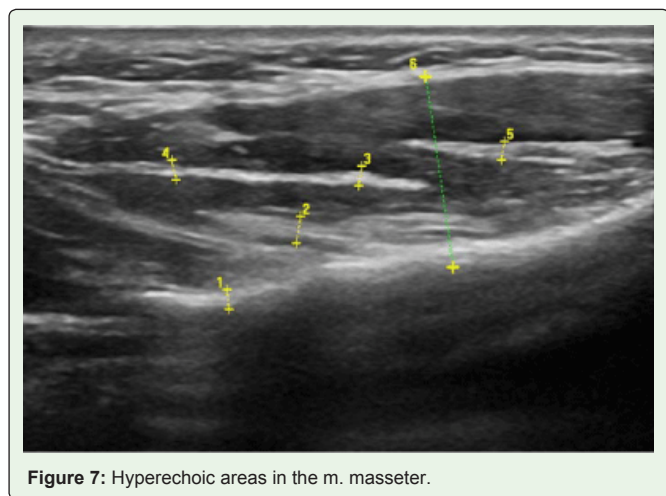
Figure 7: Hyperechoic areas in the m. masseter.

is. This is confirmed by the coefficient of rank correlation between the Impact value and the number of such sites (Gamma = - 0.38). The presence of hypo intense sites in m. masseter reduces the degree of activation of these muscles and is a marker of the pathological process caused by their functional disorders.