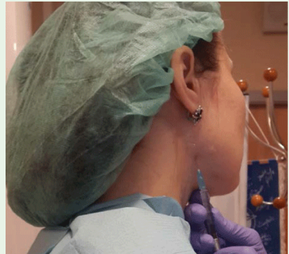
Figure 3: Injection of BTX-A into the lateral pterygoid muscle.

After 6-8 weeks from the splint treatment start, relaxation of the affected muscles was carried out by intramuscular injection of BTX-A under ultrasonography guidance. The target muscles: m. pterygoideus lateralis, m. pterygoideus medialis, m. masseter, m. temporalis. The protocol of manipulation was individual for each patient. The target muscles, the degree of their tension, the intensity of the pain syndrome, the type of movement of the lower jaw, the results of MRI were taken into account. The total BTX-A (incobotulotoxin) dose was 100 units. The dose was selected according to the recommendations of Pictorial Atlas of Botulinum Toxin Injection, Wolfgang Jost, 2008.