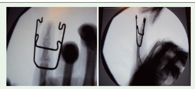
Figure 3: Intraoperative X-ray image of the fracture.

The review of the literature found few studies which evaluate this original chirurgical technique. We conducted our research on PUBmed, Google scholar, using keywords; Suzuki traction, articular fracture, PIP joint, finger [2-6]. However, this technique remains a choice in our personal experience. We will like to note that prospective series of 10 cases is ongoing for our personal long-term evaluation of this technique.