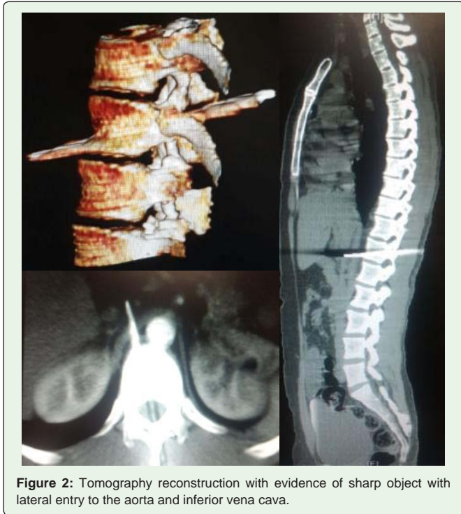
Figure 2: Tomography reconstruction with evidence of sharp object with lateral entry to the aorta and inferior vena cava.

We present an infrequent case of puncture injury in the dorsal region. Although the object was found in this region, it was decided to perform exploratory laparotomy as there was a risk of injury to large vessels and at the time of removal of the object there was a risk of massive hemorrhage. The indicated management in such situation is to perform damage control surgery since correcting the hemorrhage in a controlled way can improve the chances of survival [1].