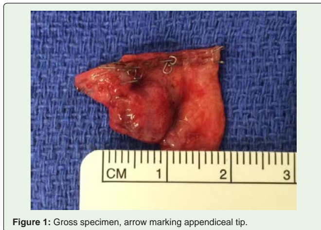
Figure 1: Gross specimen, arrow marking appendiceal tip.

The terminal ileum was inflamed and the veil of Treves was thickened and draped over what appeared to be the appendiceal base at the confluence of the taenia coli. This was carefully dissected out and a tubular structure was clearly visualized entering the cecum. The structure resembling the appendix was very short (1-1.5 cm). Its tip was very inflamed but no frank hole was seen. Nonetheless, given its very short length, we were concerned that it may have perforated into several pieces. Further dissection along the mesentery of the terminal ileum and along the pelvic sidewall, however, did not reveal any additional appendiceal fragments. Its appearance was akin to "stump appendicitis" but in a patient who had never previously had abdominal surgery. The terminal ileum was run proximally for >2 feet and nothing unusual was seen aside from the injected and secondarily inflamed bowel. The cecum and right colon were mobilized to nearly the level of the hepatic flexure, and showed no fragments of appendix or abnormal tissue.