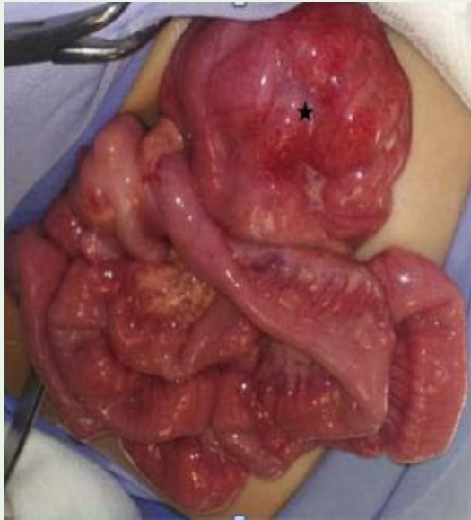
Figure 2: All jejunal loops were entrapped in a sac (*) situated on the left side of the fourth part of duodenum below the colon.

The patient underwent an exploratory laparotomy. Intraoperatively, a left paraduodenal hernia (PDH) was discovered with anomalous rotation (Figure 2). The initial adhesions were then liberated. The orifice of the herniated sac was found to be narrow, and the sac was divided to enlarge the opening before resection. The herniated bowel was healthy and there were no signs of ischemia; it was reduced and placed in the usual mesenteric position. The mesenteric defect was repaired and an appendectomy was performed. The patient recovered with no complications or further vomiting during a follow-up period of 2 years.