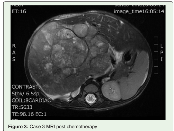
Figure 3: Case 3 MRI post chemotherapy.