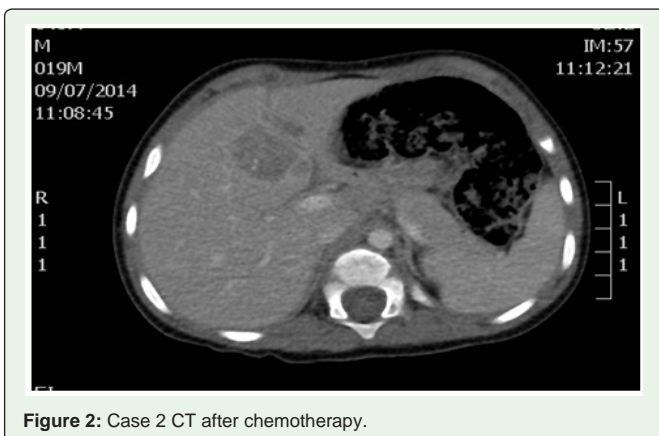
Figure 2: Case 2 CT after chemotherapy.

Twenty-month-old boy had an abdominal mass with elevated AFP (67000 ng/ml). Computed Tomography (CT) of the chest, abdomen, and pelvis revealed a large well defined heterogeneous liver mass measured 11 X 11 X 8 cm in the right lobe displacing hepatic veins and portal vein, compressing intrahepatic IVC with a right subpleural nodule (high risk PRETEXT stage III). A tru-cut liver biopsy showed a fetal type hepatoblastoma. The patient received 3 cycles of chemotherapy (cysplatine and doxorubicin). After which the AFP decreased (15 ng/ml) and CT demonstrated partial response to chemotherapy with unrespectable liver tumor. Another cycle of chemotherapy was given which made the tumor amenable resection to surgery (POSTTEXT stage II) (Figure 4). Accordingly, extended right trisegmentectomy was performed. Then, the patient developed