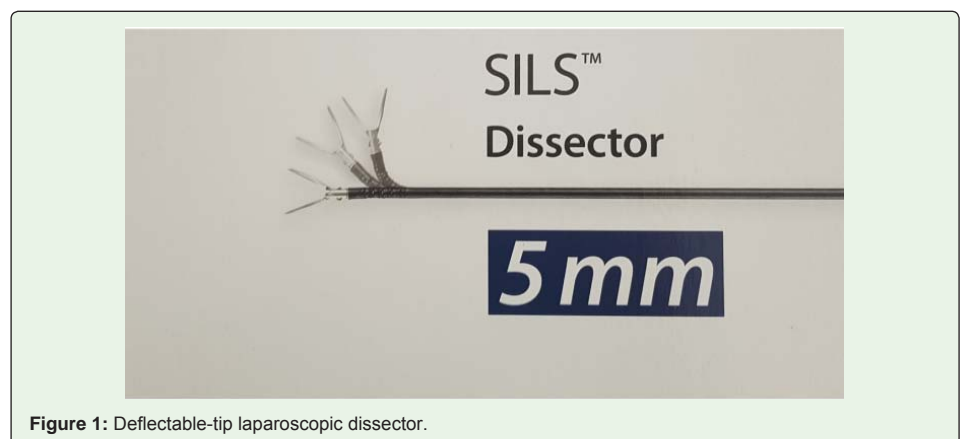
Figure 1: Deflectable-tip laparoscopic dissector.

Looking for a long, bendable-tip instrument (Figure 1) we bump into SILSTM Dissect (Covidien, 555 Long Wharf Drive, New Haven, CT, USA). It is commonly used in single incision laparoscopic surgery (SILS) by our colleagues in Pediatric Surgery, and proved useful to tackle our purpose. Once on by-pass and with an empty decompressed heart, blunt dissection between the IVC and right inferior pulmonary vein is carried out. Having developed the oblique sinus, the instrument, with a folded tape grabbed in its tip (Figure 2A), is slipped under the IVC. Then, after reaching 90 degrees deflection, the folded tape on the tip appears above the IVC pointing towards the operator (Figure 2B). Finally, the tape is grasped with shafted forceps and the flexible dissector is released.