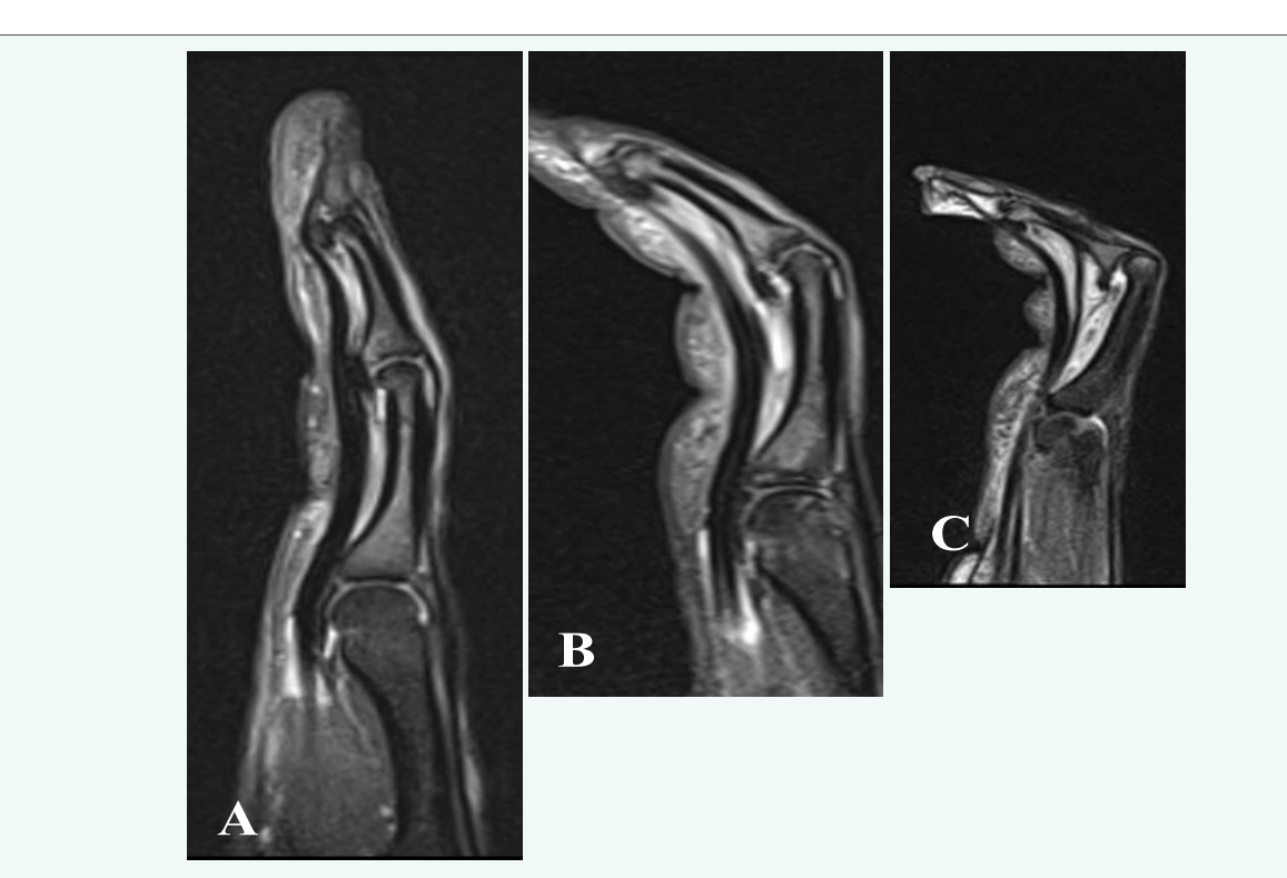
Figure 1 (A) Sagittal T2-weighted MRI following rupture of the A2 and A4-pulley with edema and hematoma in the tenophalangeal space. (B) Stress- MRI of the same person disclosed an A3-distance of 2.2 mm. Together with the clinical symptoms, this was considered to be a strain. (C) Bowstringing in a different case with an A3-distance of 4 mm.